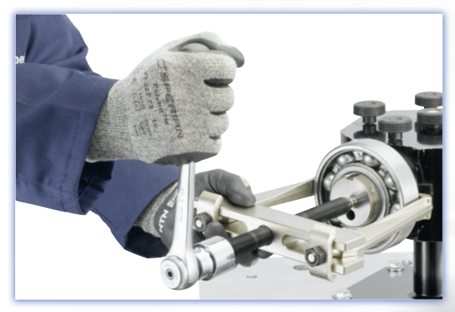
External extraction with movables 2 arms puller (possibility also of internal extraction)